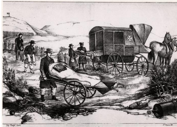
Picture of Louis Appia, project of a stretcher on wheels