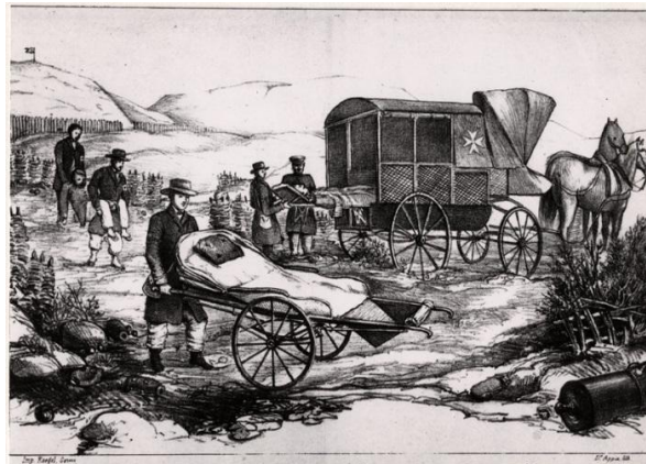
Picture of Louis Appia, project of a stretcher on wheels