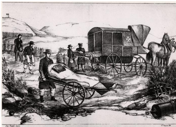
Picture of Louis Appia, project of a stretcher on wheels